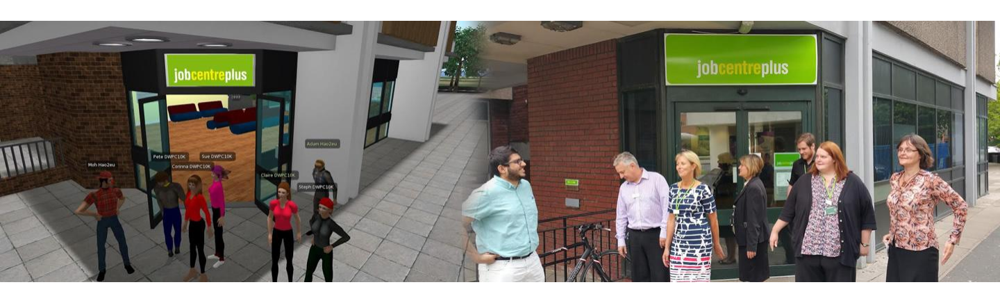
Hao2.eu is a Cyber Essentials & Business Professional Certified Member of TechUK, trade association for the UK IT Industry.

To create your own bespoke 3D environment and experiences for your users, add on our 3D Cloud Training and Support service. This enables you to commission our team of expert designers and modellers to work with your remotely via your 3D environment in an agile and flexible way that saves time and money. We can also train your users how to create their own content.